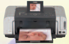
PIXMA Photo Printer