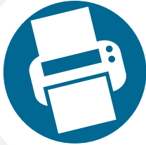
Epson Stylus C88+, NX300 or WorkForce 30

Buy an Epson Stylus ® C88+, NX300 or WorkForce ™ 30, together with any digital camera, personal computer or notebook (including Apple ® ).