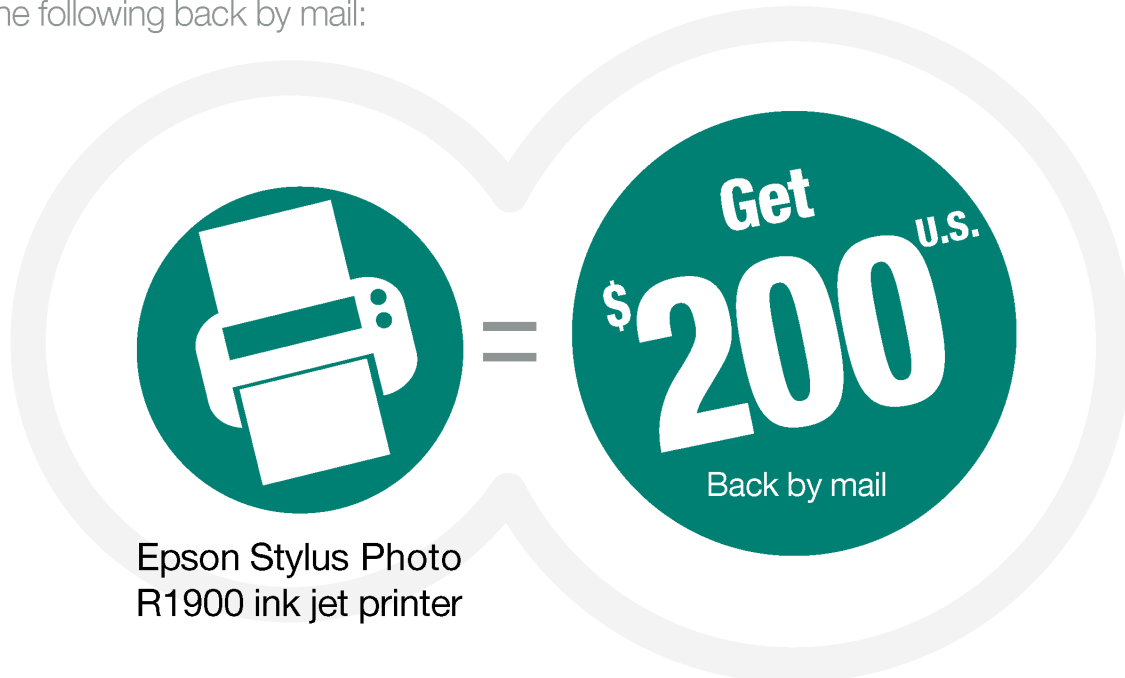
Epson Stylus Photo R1900 ink jet printer

Buy an Epson Stylus ® Photo R1900 ink jet printer and receive the following back by mail: